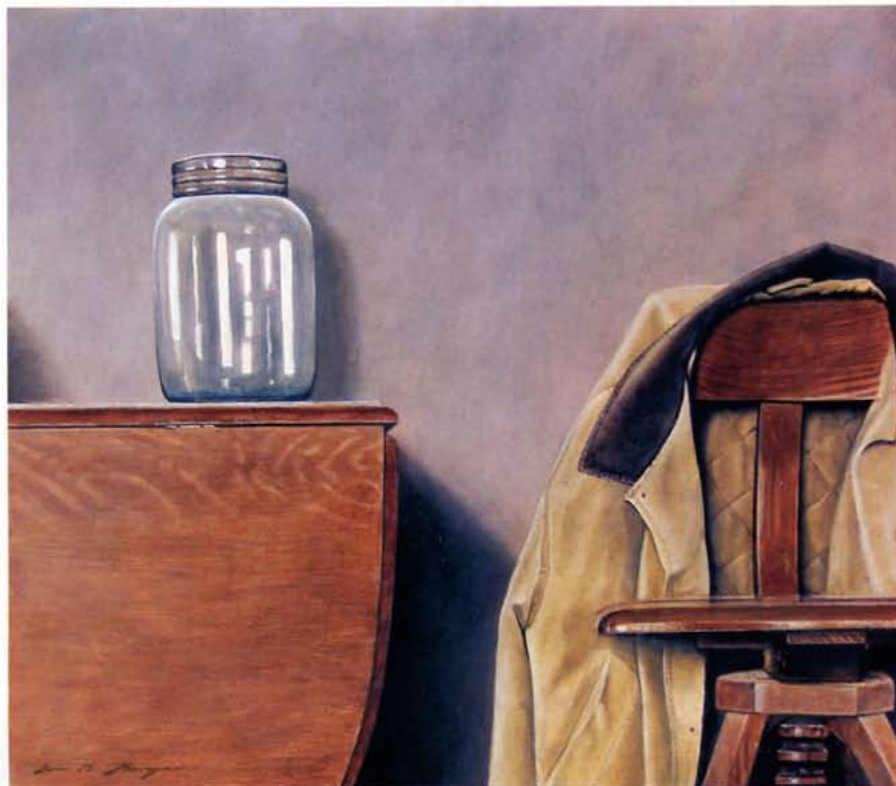
PICKLE JAR, OIL ON CANVAS, 24 X 27"