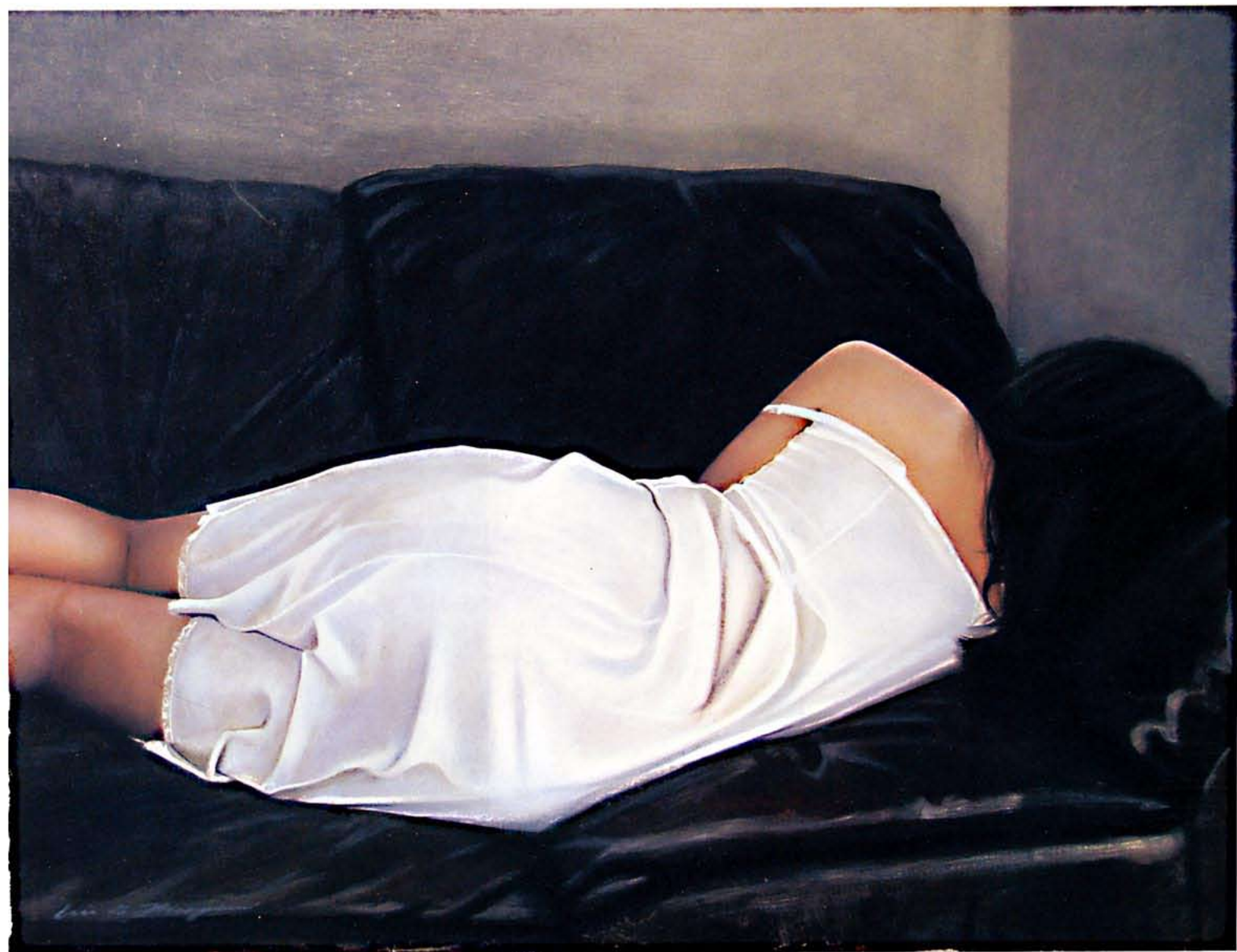
COOL REST, OIL ON CANVAS, 30 X 40"