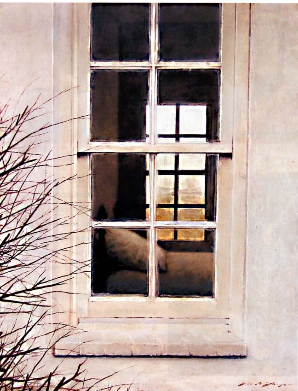
THE BEDROOM, OIL ON CANVAS, 30 X 24"

"I find objects to be very profound," says Thompson. "And when you see these objects in a different light you can almost sense the spirit or character emanating from them. I'll always pick an object over a figure because to me objects have such a powerful presence and it lets you tell a story without a person being there."