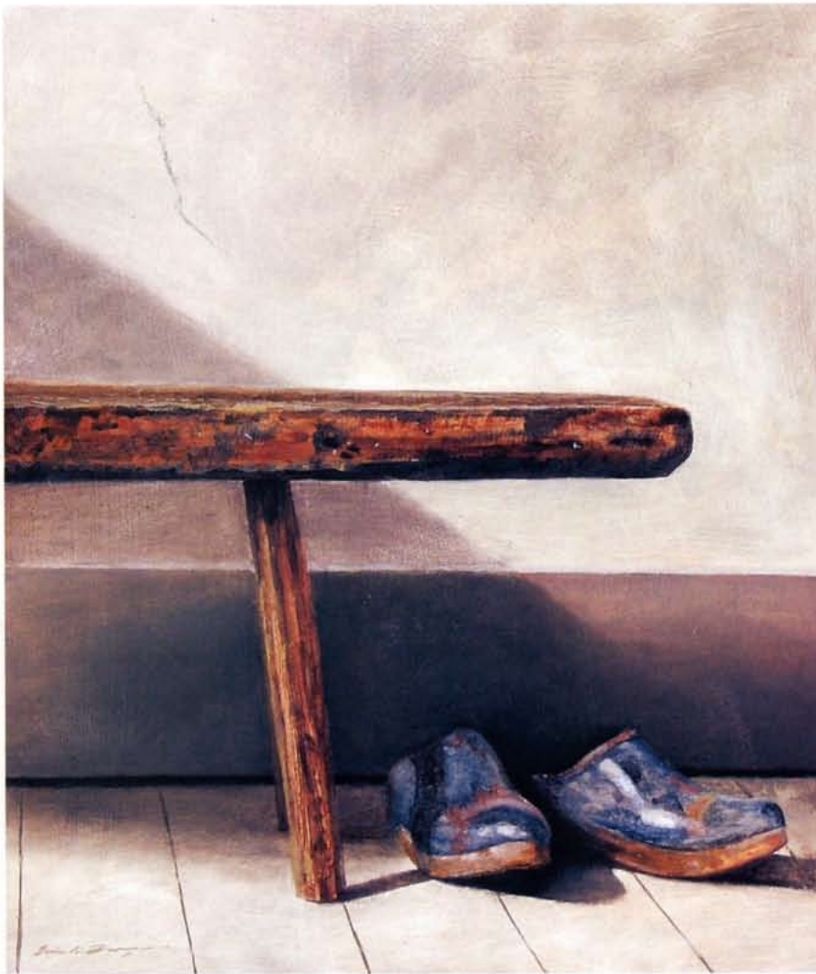
COUNTRY SHOES, OIL ON CANVAS, 28 X 24"

These objects also take on a whole new look and feel due to the play of light and shadows that Thompson directs through the canvas.